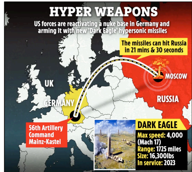
The US activates a nuclear unit in Germany. 2

On 10 November 2021, under the title " Dark Eagle has landed ", the British newspaper "The Sun" reported on a US nuclear force reactivated in Germany for the first time since the Cold War, equipped with hypersonic long-range missiles of the "Dark Eagle" type.